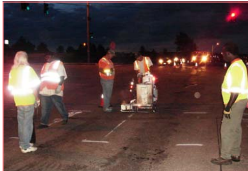
While working at night crews keep an extra eye out for drivers who are tired or driving under the influence.

Throughout the summer the night work has allowed up to two, four-person crews to tackle the City's busiest intersections when most people are home in bed and off the