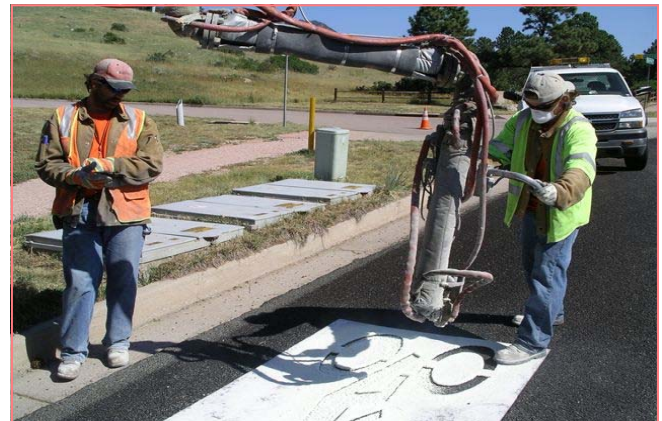
Crews mark a bike lane on a newly resurfaced City road.

bicycle lanes are often added after a road is resurfaced and needs repainting anyway. Inclusion of bicycling facilities in the design of capital improvements and development projects has also become a City standard as has combining funding when the economies of scale for dual projects make sense. And, as mentioned above, City staff pursue grants designed to advance the benefits of bicycling such as better public health, cleaner air, and reduced vehicle congestion.