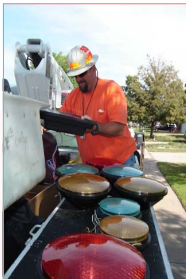
Green LED traffic signal bulbs cost more, $45 compared to $35 for red or yellow bulbs because they use more expensive gases, even though they're all 12 inches across.

The City is responsible for about 30,000 traffic signal light bulbs at 520 signal-controlled intersections.