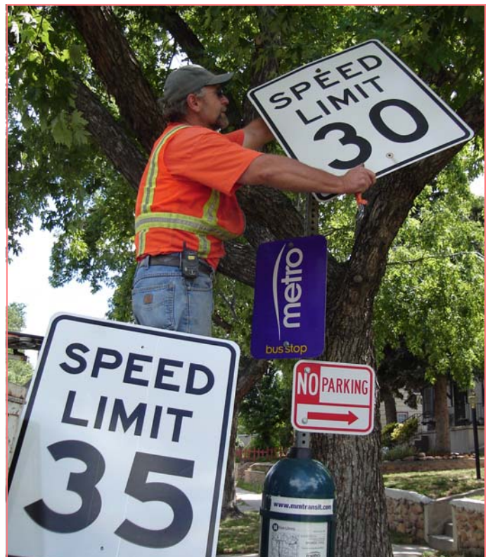
Driver speeds decreased or remained the same in nearly 85 percent of the tested locations where speed limits were raised to accurately reflect current conditions. The speed changes should lead to safer traffic flow, due to less variation in driver speeds, and better ability for police officers to ticket violators.

Though no overall modifications to the system are expected in the near future, evaluating speed limits is an on-going, though time-consuming, service and residents may request an evaluation by calling the City's Traffic Engineering Division, (719) 385-5433.