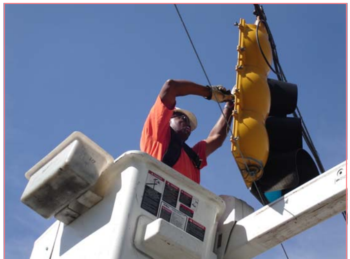
When City crews replace the overhead hanging signals they also replace the lights on the side poles and pedestrian crossing signs with brighter LED lights.

two years while LED bulbs last five to 10 years. The longer life means City staff have to change out fewer bulbs and respond to fewer outages. In 2004, the City received approximately 3,000 signal malfunction calls related to bulb outages. Since then, the